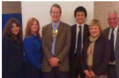
Ambassadorial Scholars take Priority by storm and provide an excellent evening, truly remarkable....